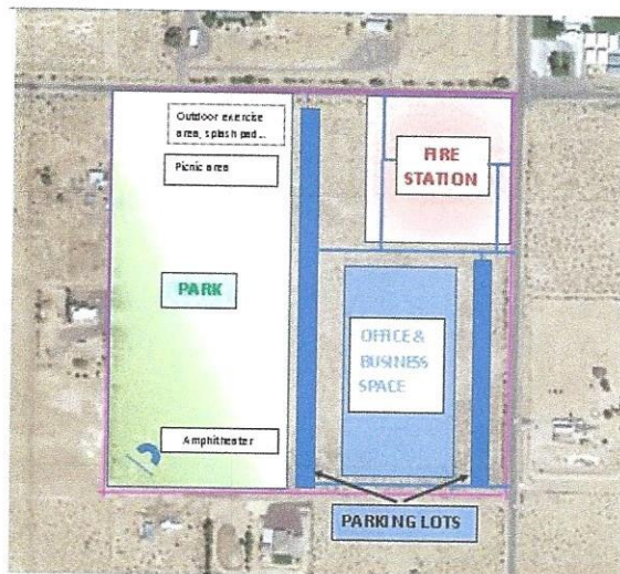
(Draft) CIVICHUB (V3)